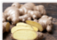
Himalayan Mountain Ginger