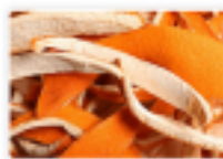
Seville Orange Peel (p-synephrine)