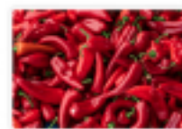
Andalusian Red Pepper