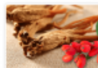
Berberine & Korean Red Ginseng