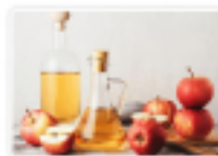
Spanish Red Apple Vinegar