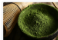
Ceremonial Green Tea