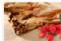
Berberine & Korean Red Ginseng