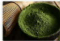
Ceremonial Green Tea