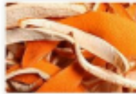
Seville Orange Peel (p-synephrine)