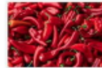
Andalusian Red Pepper