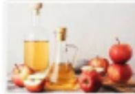
Spanish Red Apple Vinegar