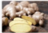
Himalayan Mountain Ginger