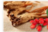
Berberine & Korean Red Ginseng